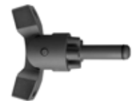
Child's Rocker Arm (439A1091)