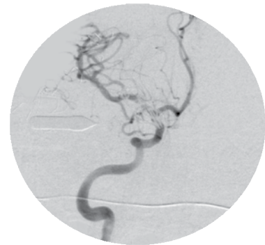
DSA image with MAYFIELD® Radiolucent Skull Clamp in use.