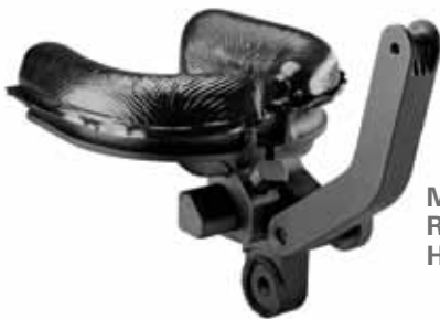
MAYFIELD® Adult Radiolucent Horseshoe Headrest (A-2010)