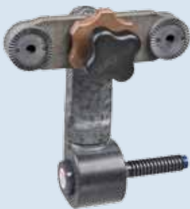
Tri-Star Swivel Adaptor (A2111)

The MAYFIELD Infinity XR2 Tri-Star Swivel Adaptor accessory provides the additional starburst for when image-guided surgery systems are required.