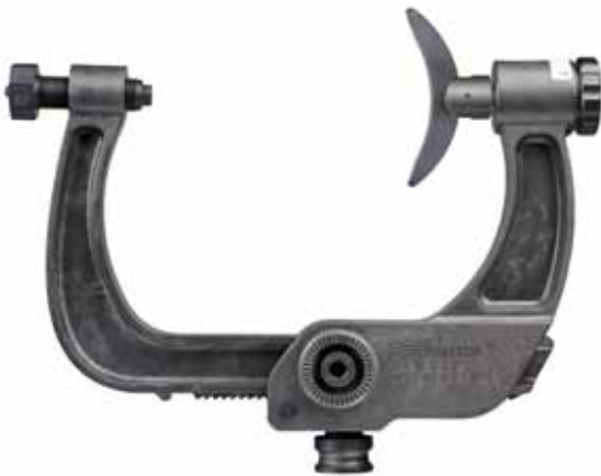
MAYFIELD Infinity XR2 Skull Clamp (A2114)