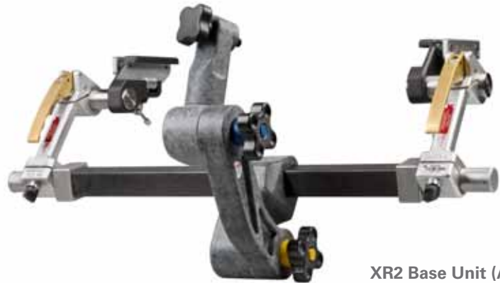
XR2 Base Unit (A2079)