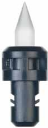
MAYFIELD Radiolucent Skull Pins (A 2020)

MAYFIELD® Radiolucent Skull Pins are engineered from synthetic Sapphire material to significantly reduce or limit artifact during CT and MR imaging procedures