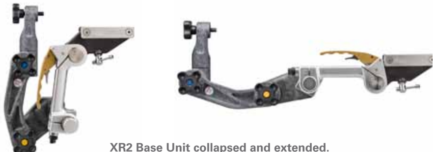
XR2 Base Unit collapsed and extended.