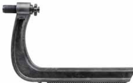
Metal-Free Conversion Accessory (439A1092)