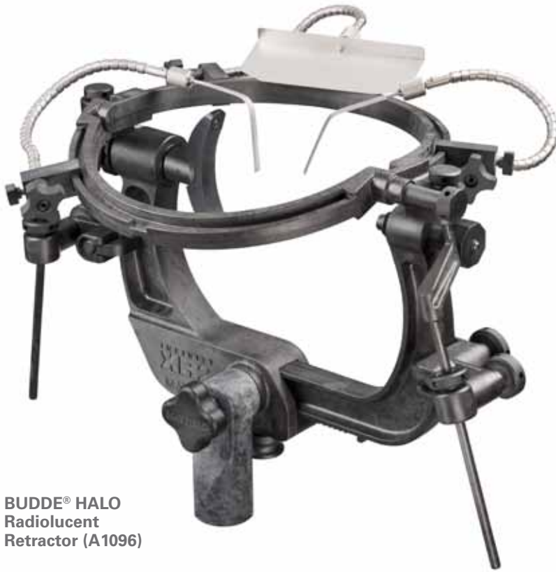
BUDDE® HALO Radiolucent Retractor (A1096)

Optimal Efficiency – Remains in place while imaging.