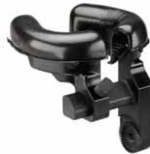
MAYFIELD® Pediatric Radiolucent Horseshoe Headrest (A-2011)