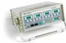
EnligHTN RF Ablation Generator