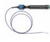
EnligHTN Renal Artery Ablation Catheter